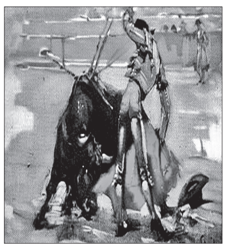
Matador vs bull

KEEP IN MIND: As we will see in the next chapters, the pawn exchange 5...dxe5 is a less attractive defensive option, but it usually serves to reduce White's initiative. After 6.fxe5 in this concrete case, the best method for Black would be 6...②fd7 7.②f3 c5!≠.