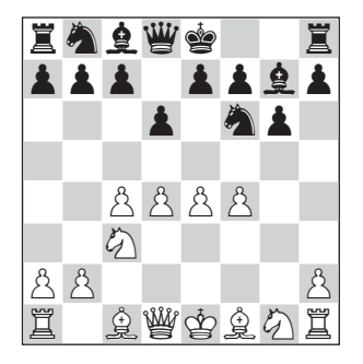
(Four Pawns Attack vs KID)