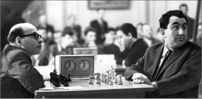
Bronstein vs Petrosian